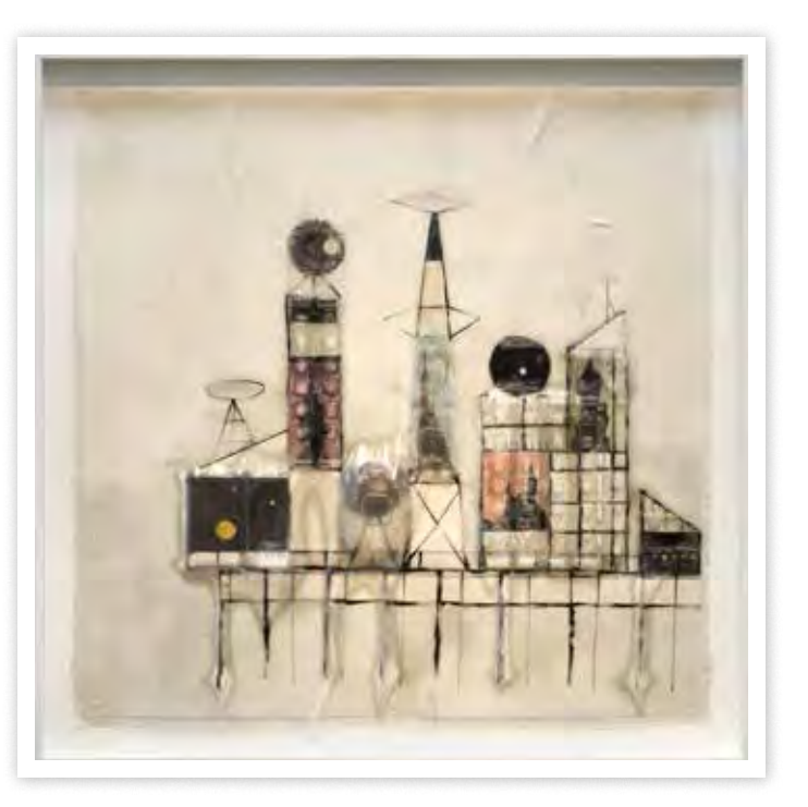
BELOW: "Estero Rush," 2010, Ink and gouache on paper. BOTTOM: Work in progress on "Around the Vast Blue," a 60-inch globe commissioned for the Nevada Museum of Art's 2015 exhibition, "Tahoe: A Visual History."