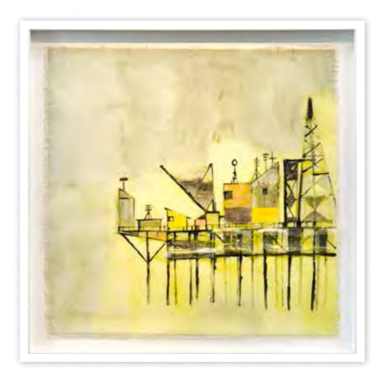
ABOVE LEFT: "Pier Two," 2014 — ink, acrylic, plastic, bio-resin, fiberglass on paper — courtesy of Shoshana Wayne Gallery ABOVE RIGHT: "Listening Platform," 2015 — ink, acrylic, plastic, bio-resin, fiberglass on paper — courtesy Shoshana Wayne Gallery.